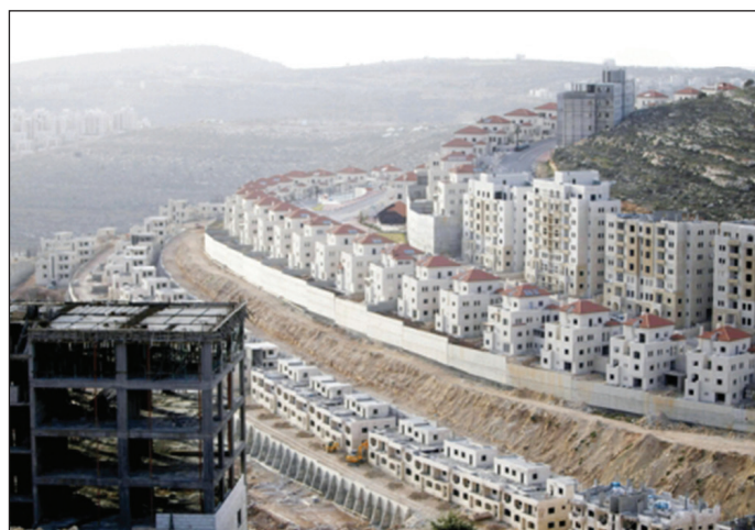
Illegal Israeli settlement construction in the occupied West Bank continues apace

T oday there are approximately 125 Israeli settlements in the West Bank and twelve neighbourhoods in Jerusalem. There are also a further 100 "settlement outposts" – these are smaller